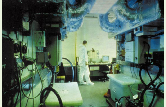
Figure 1 The Ecotron experiment creates model multitrophic community assemblages containing plants, herbivores, parasitoids and decomposers in 16 different chambers. The Ecotron is an ambitious attempt to bridge the scale between field communities and laboratory experiments. (Photographs show the inside of an Ecotron chamber and a technical service corridor between two banks of chambers; courtesy of the Centre for Population Biology, Imperial College at Silwood Park.)

fairly regular waxing and waning of a population's density). Such background population variability, whether driven by biotic or abiotic processes, can provide species with the opportunity to respond differentially to their environment. In turn, these differential species responses weaken the destructive potential of competitive exclusion.